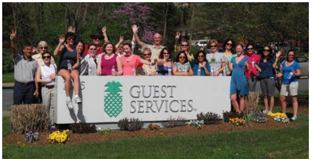
Guest Services' corporate office staff walk for a healthy heart.

Guest Services' Corporate office geared up with a team of 23 walkers for a 1.2 mile walk. Despite it being one of the hottest days of the year, our walkers completed the task with lots of energy, camaraderie and smiles.