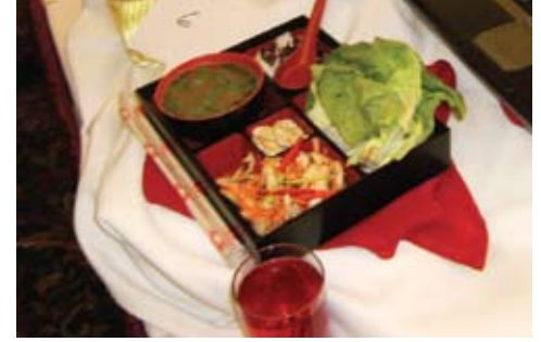
Award winning cooking contest entry.