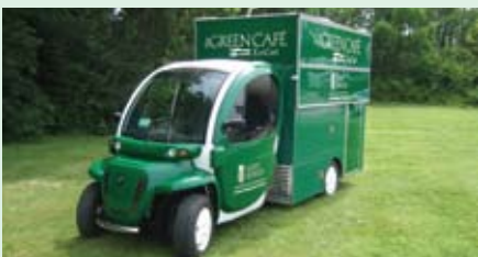
GSI GEM cart

The cart gets from place to place just as any car would: on area roads. As strange as it might look, it holds its own quite well on the road (as long as the driver stays under 35 MPH), and can easily get anywhere it needs to go on a charge. There is typically one driver/operator, who also serves as kitchen attendant/cashier/server.