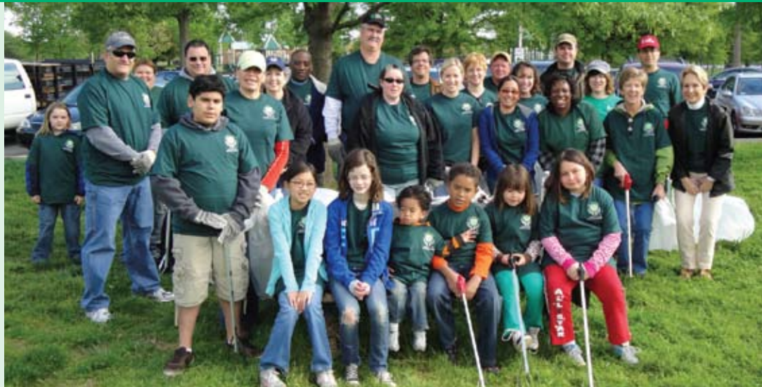
Employees, families and friends of Guest Services gathered for the second annual Clean-a-Park Day at Hains Point in Washington, DC.