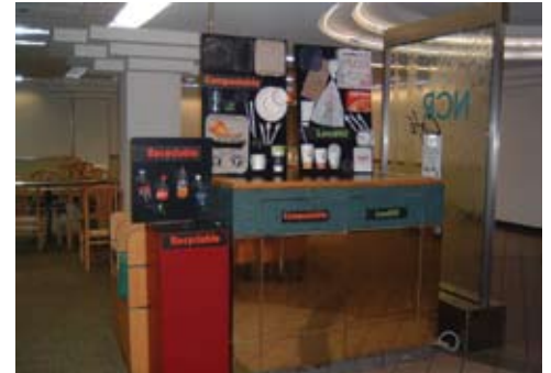
ROB recycling program

NRC Café is an important participant in the process and we are proud to be helping GSA's Regional Office Building lead the way towards a greener government.