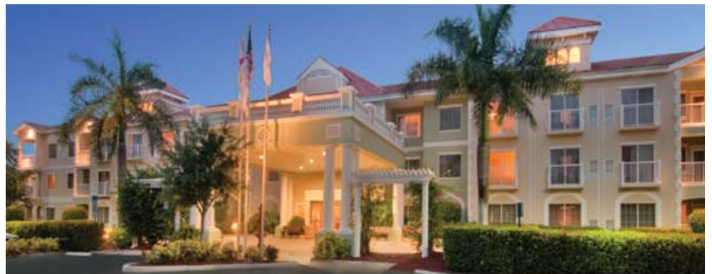
Doubletree Guest Suites